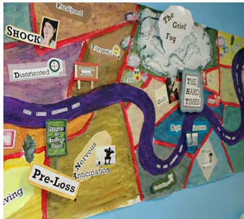
"At Cork's you could casually acknowledge just exactly where you were at in your journey of grief by glancing at the array of colors signifying how you felt."

Also, when you do experience a tragedy, remember that your story will be similar, but at the same time completely different, from the person sitting next to you. Last but not least, grief will never completely go away—it continues to change. It ebbs and flows throughout our life, and takes different forms as we experience new things. And even though I never thought I'd say this, it does get better with time. 🕊